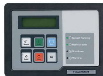
PowerStart 500 control operator / display panel

Note – An RS-232 or USB to RS-485 converter is required for communication between PC and control.